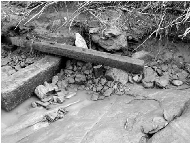
Figure 1. Timbers exposed at Falling Creek

A series of floods, starting with Hurricanes Fran (1996) and Isabel (2003), and Tropical Storm Gaston (2004), has uncovered remains of the earliest blast in America. The storms eroded earthwork remains of the dam and exposed a set of massive timbers (Figure 1). Those timbers are seen as part of the 1621–1622 Falling Creek blast furnace building set.