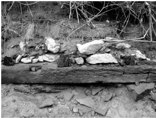
Figure 2. Timbers exposed at Falling Creek

question was whether the furnace had gotten into blast prior to March 22, 1622. We then did a geophysical survey of the property. Resistance survey showed what appeared to be large buildings on the floodplain. They were consistent with warehouses that Cary had that were burned by Arnold in 1781. Magnetometer survey showed a massive magnetic anomaly consistent with a blast furnace exactly where all and sundry had thought it should be. The magnetometer survey was the first indication that the furnace had gotten into blast. That massive anomaly proved that the Virginia Company had fired the furnace. So, either the furnace actually got into production for a short period or it was knocked out just as it got into production by the Powhatans.