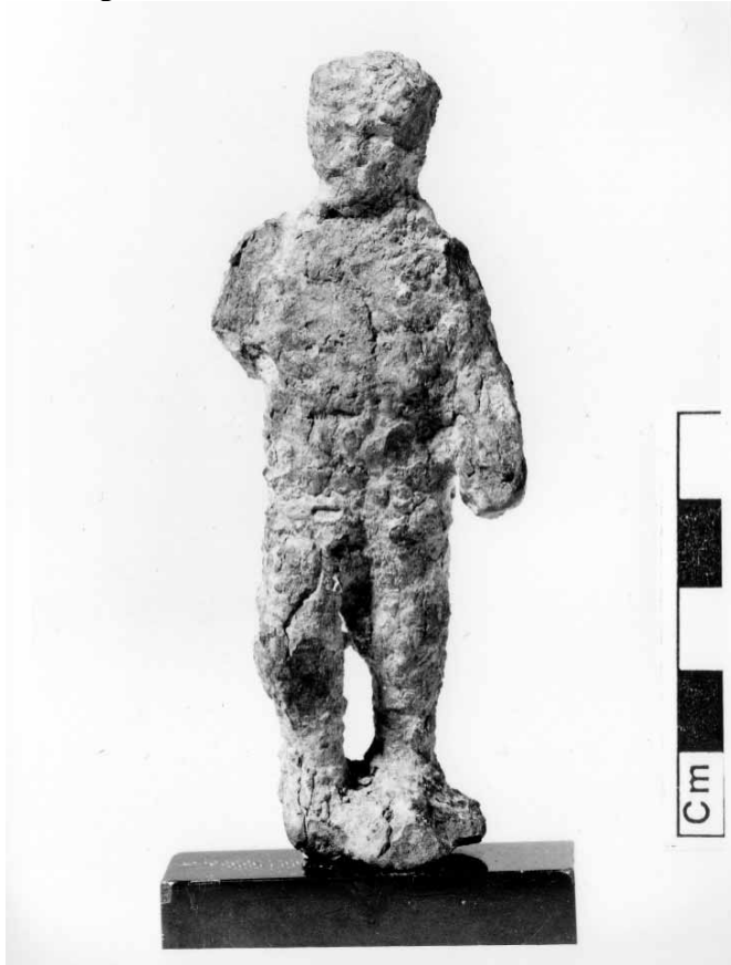
Figure 2. Cast iron standing figure, Hastings Museum and Art Gallery Reg. 997.45.

was always difficult to check his story). Shortly afterwards Charles Hercules Read presented the figure at a meeting of the Society of Antiquaries of London with Dawson in the audience (Read 1893). To what must have been his great mortification in the discussion that followed the authenticity of the figure was challenged.