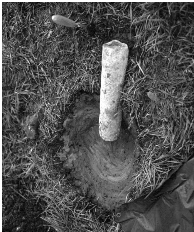
Figure 1 Clay-lined smelting hearth with tuyère in place before use.