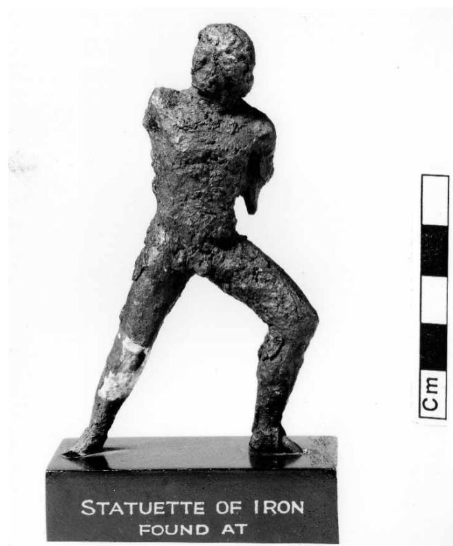
Figure 1. Cast iron figure of a horseman, Hastings Museum and Art Gallery Reg. 917.4.

Charles Dawson, the perpetrator of the Piltdown forgery, already had a long string of other remarkable discoveries to his credit (or discredit) when he began his greatest escapade. Most of these were accepted during his lifetime, and their subsequent unmasking as forgeries remains one of the principal reasons for believing that Dawson was the main, probably the sole, perpetrator of the Piltdown fraud (Russell 2003; Walsh 1996). One of his discoveries, the small iron figure supposedly from the Roman iron smelting site at Beauport Park, near Hastings in Sussex (Figure 1), has a