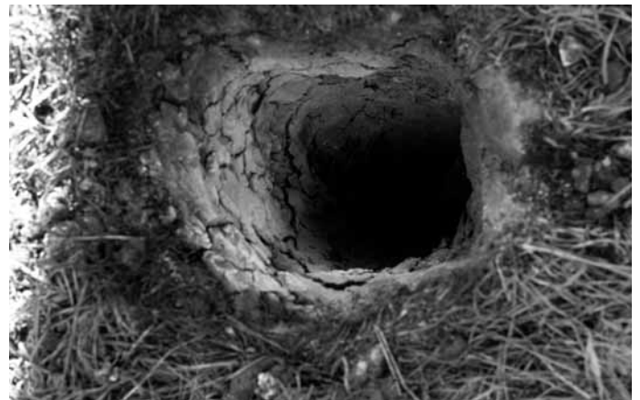
Plate 4 Looking down at the top of the ‘post hole’ smelter after successfully smelting tin. Note the grass is barely singed, and the white coating of tin oxide on the heat-cracked clay lining.

High grade malachite from Zaire and cassiterite from Cornwall (panned from Geevor Mine tailings) were chosen for the smelting. Both of these ores contained approximately 60% metal. The various smelting units were given a short pre-heat mainly to dry the clay before serious smelting started, charging the ore as a powder or in some instances putting it in one of the rough crucibles in the charcoal before the tuyère or blow pipes. Thermo-couples were usually placed in the tuyère zone and at some point on the wall of the unit, and the temperatures rapidly rose to between 1,000° and 1,200°C. Smelting times were typically between about 90 and 240 minutes, by which time the surrounding soil was barely warm and the grass hardly singed (Figure 6).