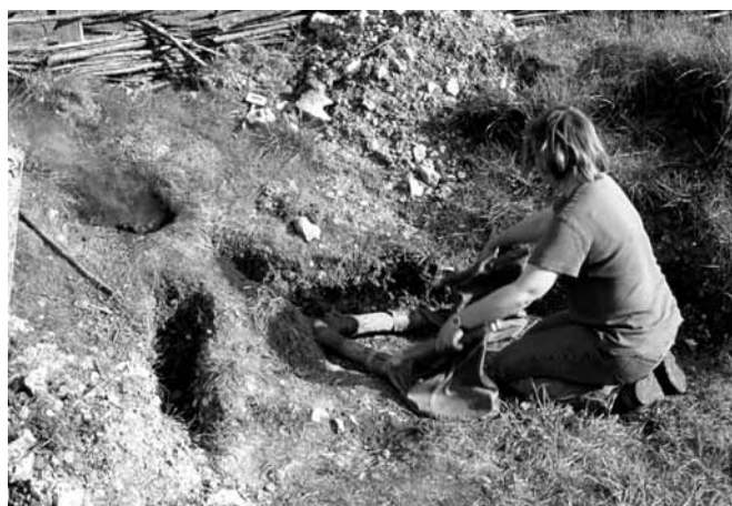
Figure 3. A bank smelter in operation blown with a double bag bellows.

experiments with non-ferrous metals carried out at the 1994 HMS meeting at Flag Fen (Timberlake 1994) and the iron-smelting work carried out by Peter Crew (Crew 1991 and in the previous Newsletter). The particular problem we chose to address was the absence of smelting evidence from Bronze Age Britain. We have the mines and the metalwork but as yet few traces of smelting activity have been recognised. One explanation could be that the smelting processes produced little or no durable waste. Thus we designed a number of smelting 'units' to see if metal could be produced in the most simple and ephemeral kind of hearths, and, if similar operations had taken place in prehistory, what sort of evidence the archaeologists should be looking for. It was hoped that this sort of carefully monitored experimentation would raise a host of new questions